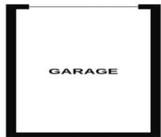
1ST FLOOR 388 sq.ft. (36.1 sq.m.) approx.